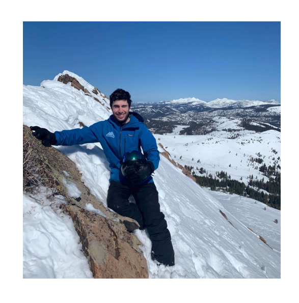
Sponsored Features Businesses can have their product or destination highlighted in a new article/video or featured prominently on our site/socials.