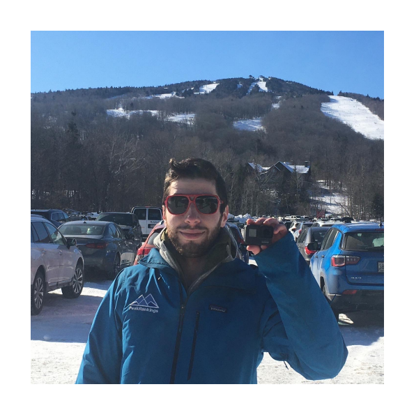
Video Collaborations We establish video partnerships with eligible businesses, combining a PeakRankings video with a corresponding highlight on their website or socials.

peakrankings.com | admin@peakrankings.com | PeakRankings