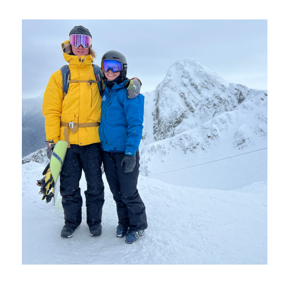
Guest Posts We welcome guest posts from outdoor-oriented businesses, allowing them to share their expertise and promote their brand.